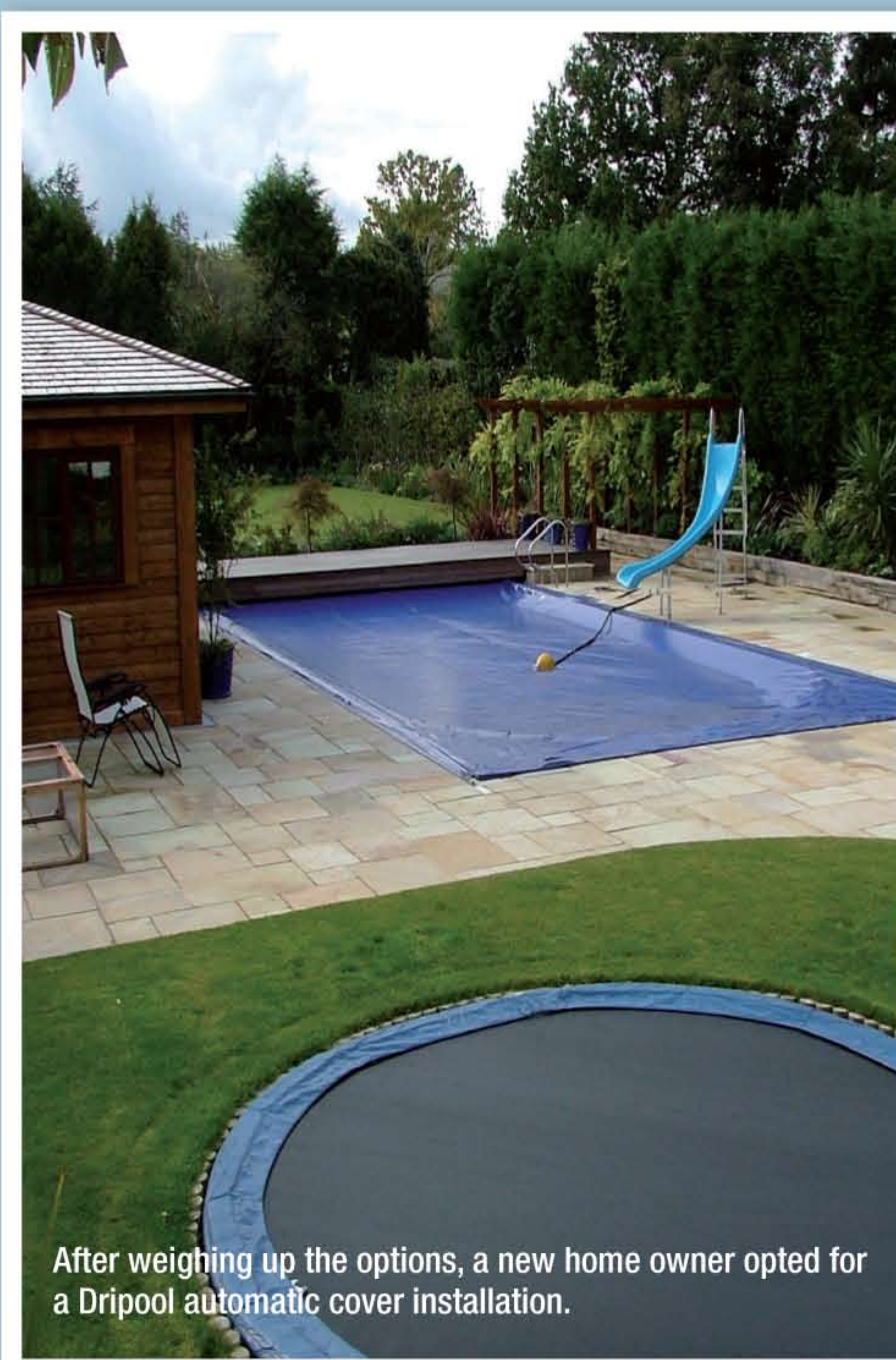
After weighing up the options, a new home owner opted for a Dripool automatic cover installation.

The new system is hydraulically driven and utilises an intelligent gear system which controls the cover speed when uncovering; a problem that has previously been insurmountable on pools of this size. By utilising our unique winding operation, a pool of this size now provides no problem for us.