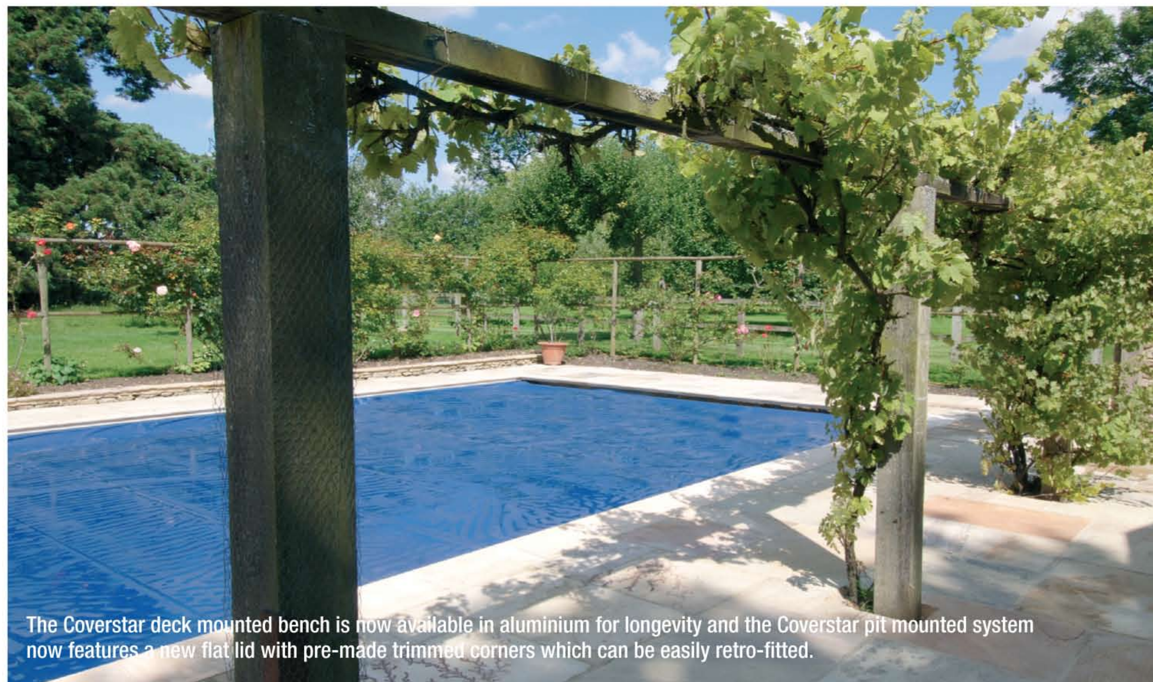
The Coverstar deck mounted bench is now available in aluminium for longevity and the Coverstar pit mounted system now features a new flat lid with pre-made trimmed corners which can be easily retro-fitted.

Others are opting for ease of operation: “We installed an automatic safety cover because my husband has arthritis and could not pull a manual cover back and forth across the pool