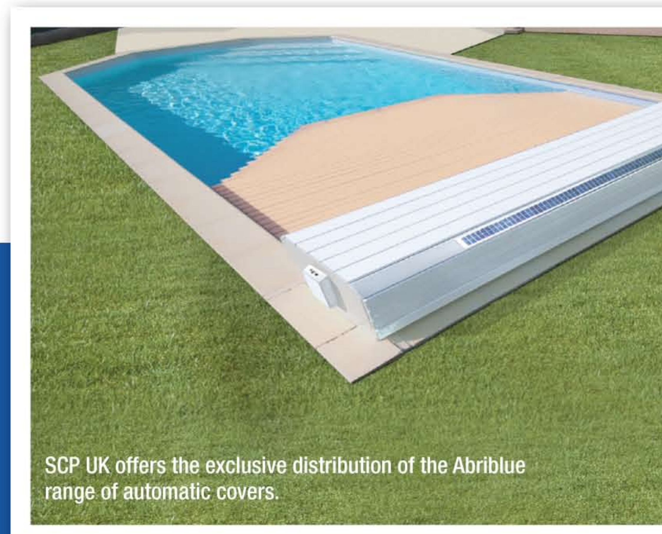
SCP UK offers the exclusive distribution of the Abridblue range of automatic covers.

"Where we have their covers on display pools, we are selling more than one a week from the show sites.