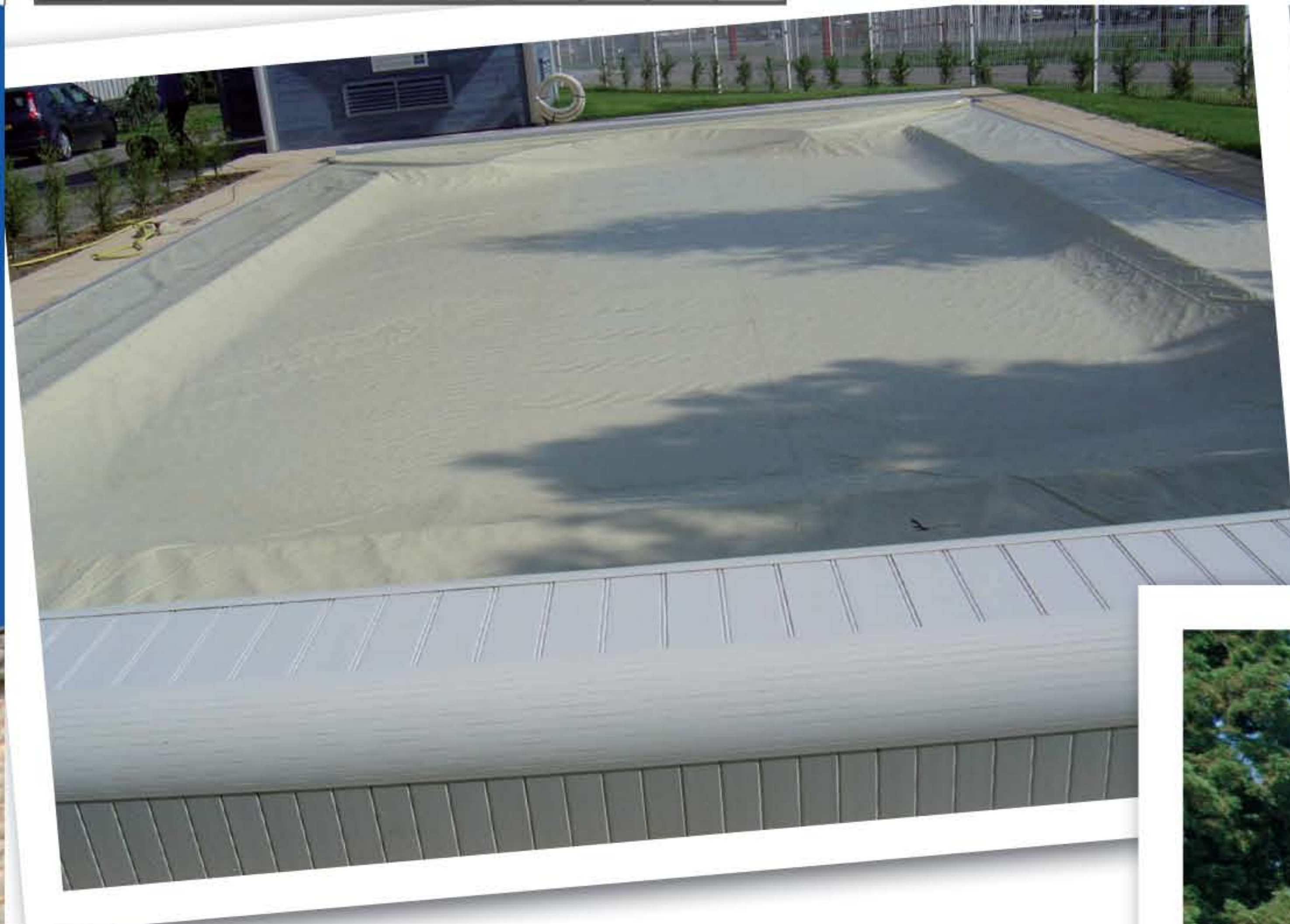
LEFT: New to the UK and available through ProCapi UK, the Walu-Lock vinyl automatic safety cover is available in five different models and five colours with a three hose hydraulic system with safety relief valve for additional safety. All covers conform to the strict French safety standard NF P 90-308.

from the pool at noon on a sunny day and the water temperature rose by 5 degrees within one hour of removing the cover.”