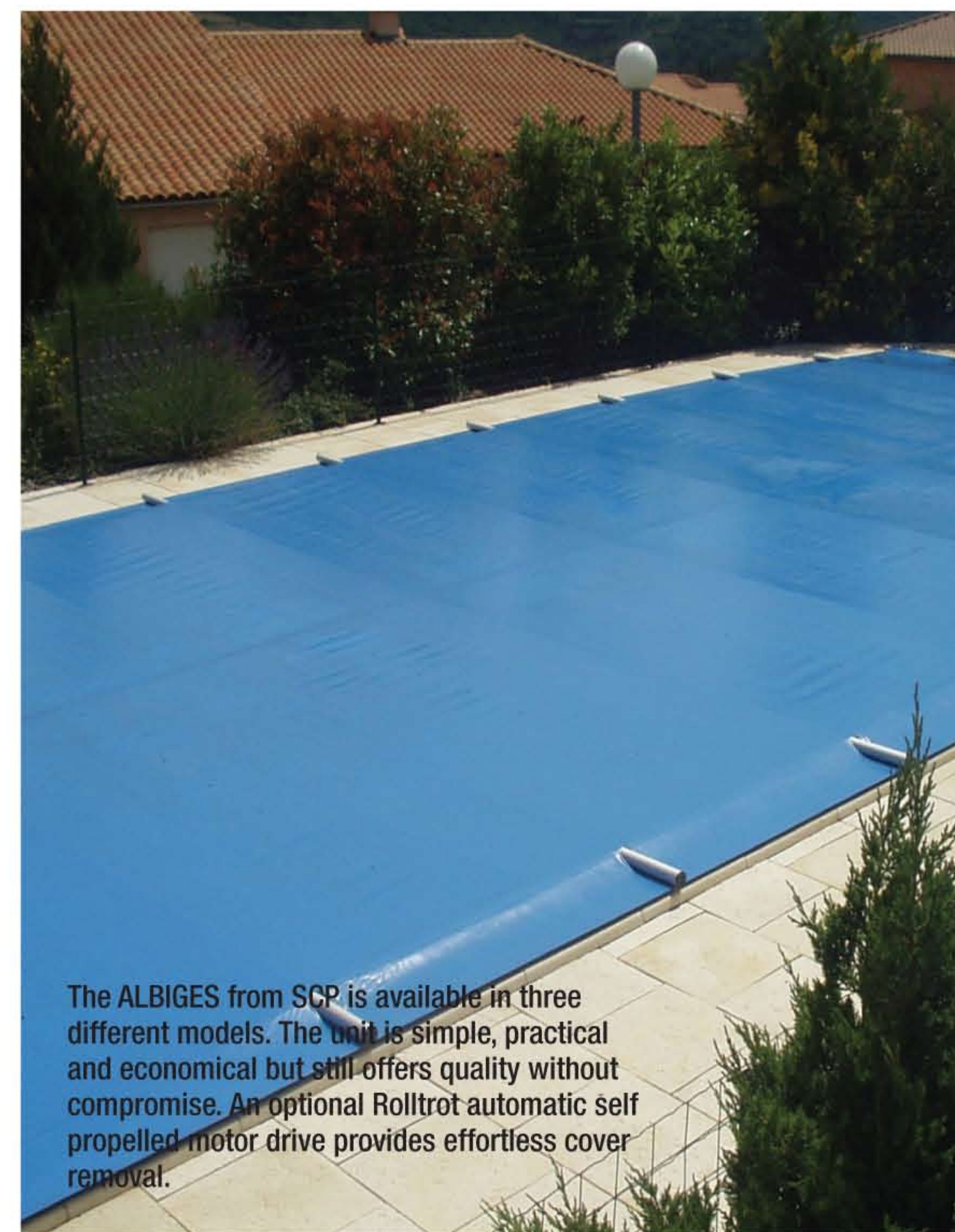
The ALBIGES from SCP is available in three different models. The unit is simple, practical and economical but still offers quality without compromise. An optional Rolltrot automatic self propelled motor drive provides effortless cover removal.

Production of the Coverstar safety cover has moved from Certikin North to Certikin’s new