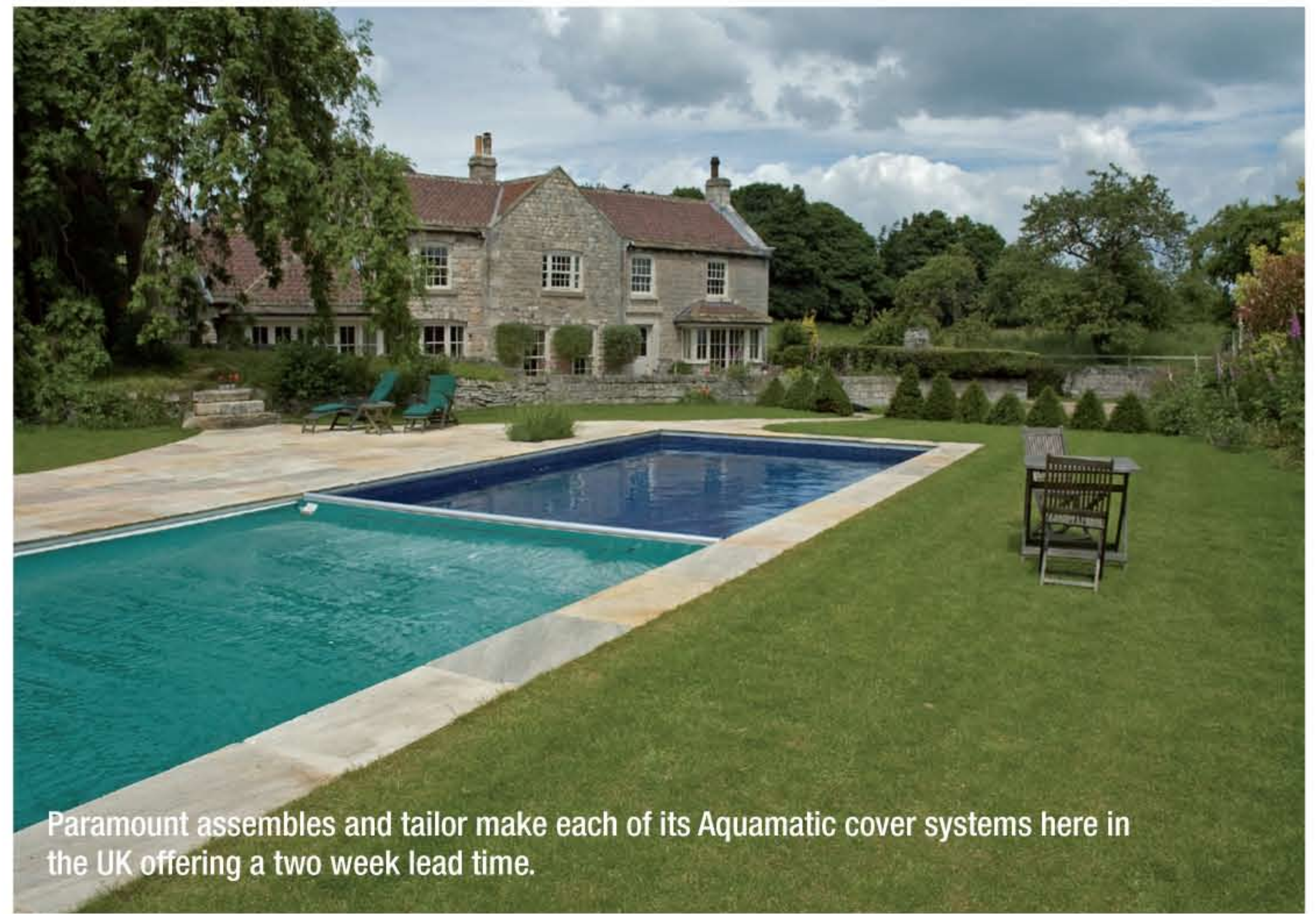
Paramount assembles and tailor make each of its Aquamatic cover systems here in the UK offering a two week lead time.

Available in seven different colour fabrics, AQM cover fabrics are laminated for