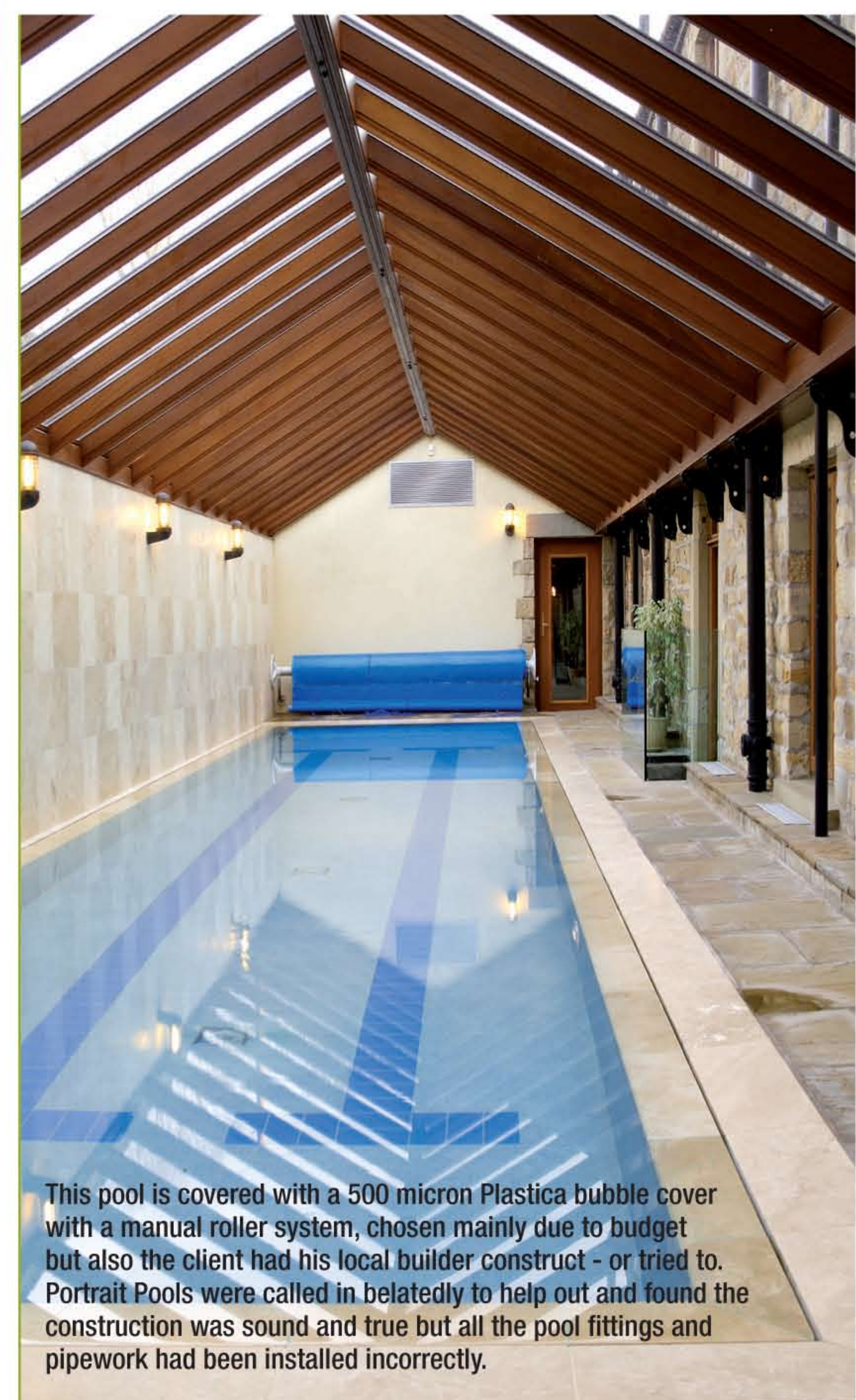
This pool is covered with a 500 micron Plastica bubble cover with a manual roller system, chosen mainly due to budget but also the client had his local builder construct - or tried to. Portrait Pools were called in belatedly to help out and found the construction was sound and true but all the pool fittings and pipework had been installed incorrectly.

AQM cover systems have two independent hydraulic drive motors – one hydraulic motor to take the cover on and a second to take the cover off. Both incorporate a reverse flow manifold. Suitable for indoor and outdoor installation and requiring a small pit housing of 350mm x 450mm, the AQM cover system has an extensive 20 year warranty on the drive system and a seven year pro rated fabric warranty with warranty certificates issued upon installation. It is supplied with a hidden leading edge bar and can lift up to 10,000 kg. The AQM system offers a range of different maintenance free pit housing lids such as polymer, tiled or synthetic wood as standard. There is also a stone lid housing option for liner or concrete pools.